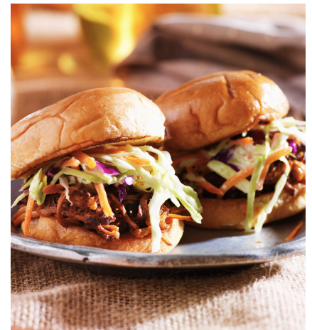
Pulled Pork Slider Station