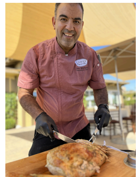
Roast Turkey - Butcher Shop Station