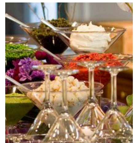
Mashed Potato Martini Bar

Please note that all purchases including Food & Beverages are subject to a 22% Service Charge and applicable taxes.